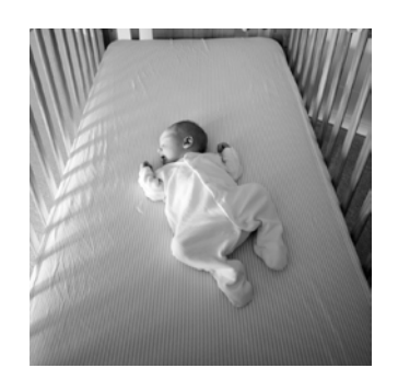
Do not place pillows, quilts, pillow-like toys, or anything in the crib.