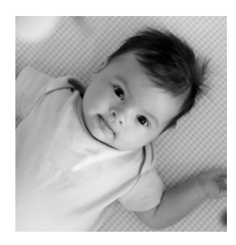
Face up to wake up – healthy babies sleep safest on their backs.